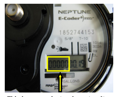
This is a new electronic meter. It will give more accurate reads. The first 5 numbers are your water "USE".