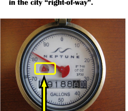
That red triangle will turn if any water is flowing through the meter. If all the water is off and it's turning, you probably have a leak.