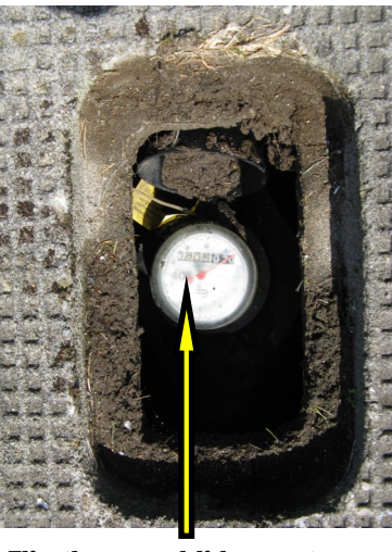
Flip the round lid open to reveal the meter face. Can you see the small red triangle? That's a flow indicator, sensing small flows of water through meter.