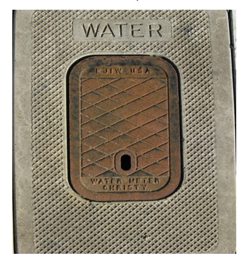
Here's a typical water meter box. It's often found in front of your house near the street in the city "right-of-way".

Your water meter records how much water you have used. It may be able to tell you if you have a leak, which can lead to higher-than-normal water bills. This brief guide will help you find your meter, read the meter, and, best of all, know what it means. Let's get started!