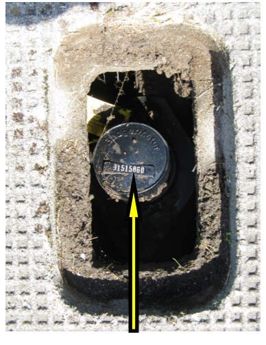
Take off the metal lid to reveal the water meter. You might need to remove some dirt to get to it. That number is your water meter number.