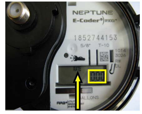
These meters will be installed over time. It will alternately flash a "USE" and "RATE" window. If all water is off, anything over 0.00 in the "RATE" window means a leak.