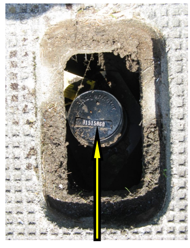
Take off the metal lid to reveal the water meter. You might need to remove some dirt to get to it. That number is your water meter number.