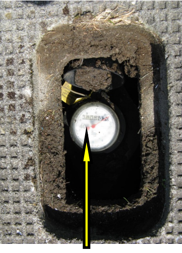
Most meters are now electronic meters; yours may look a bit different but all have a "face" reader display. Open the cover to reveal the meter display.