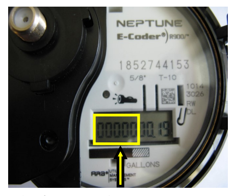
The first 4 numbers are your water "USE" in thousands of gallons. It will also show "RATE", or how much water is being used