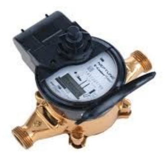
This is the new electronic meter. It will give more accurate reads. Note the digital read window on the meter's face. Also note photocell that powers the reading; shine a flashlight on it to activate it.