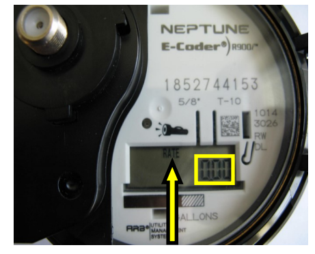
It will alternately flash a "USE" and "RATE" window. If all water is off, anything over 0.00 in the "RATE" window means you have a leak!