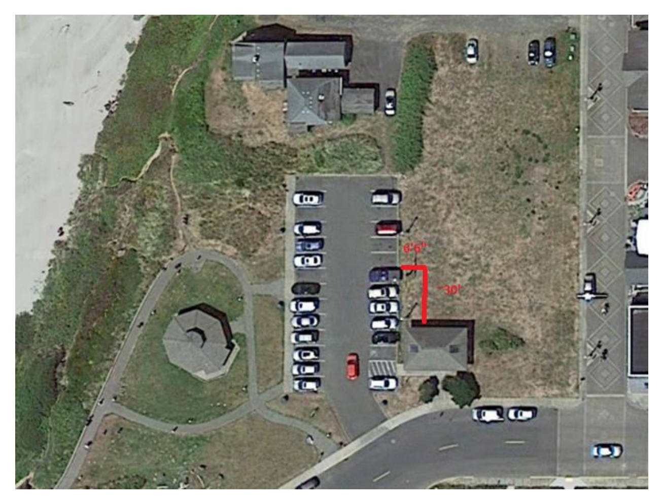
Approximately 30', and 6.6' from Curb.