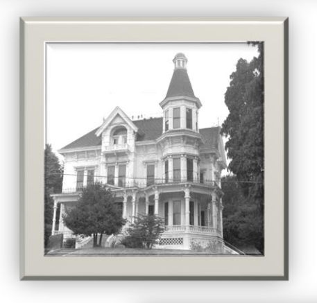
RATHER, IT'S JUST THE BEGINNING!