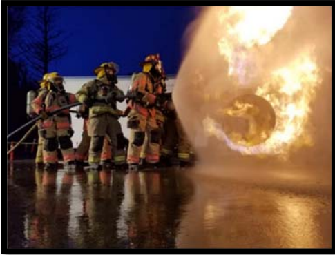
Fire Training Exercise