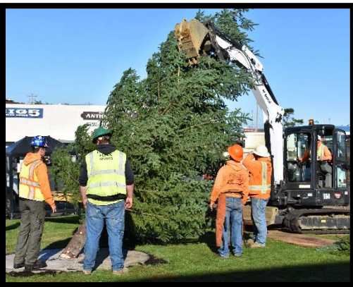
Public Works Tree Installation