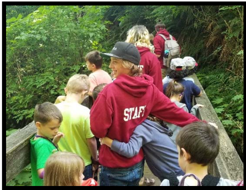
Parks and Recreation Hike