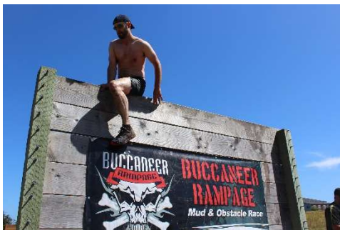
Buccaneer Rampage 2018