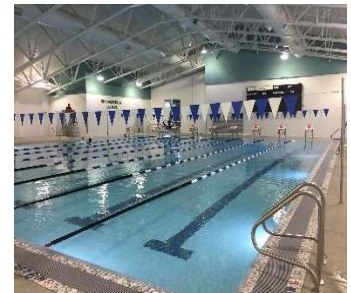
Swimming Pool-Aquatic Center