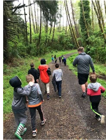
Hike on the Ocean to Bay Trail