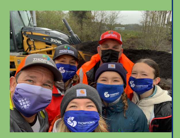
Two photos from our Earth Day Compost giveaway to the public. We gave away 86 pick-up loads of compost.

"We pride ourselves in being community partners and active at the local and state level in improving waste practices and doing what we can to educate ourselves and the public about sustainable and best practices. We consciously operate our business with these guiding values: Integrity, Safety, Excellence, Teamwork, Accountability, and Environmental Sustainability."