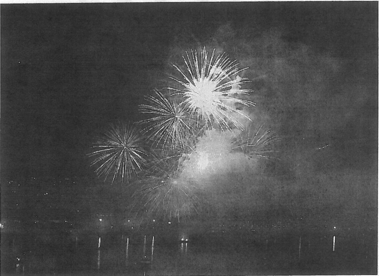
Western Display Fireworks provided the fireworks and service for the show, which they do for many other towns. Newport was able to budget an additional $10,000, totalling $30,000 for this year's show.